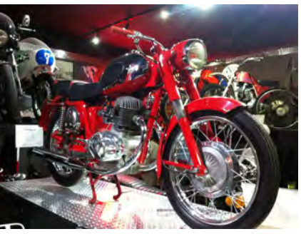
Rare Honda Race bike—these are usually destroyed after their racing life.